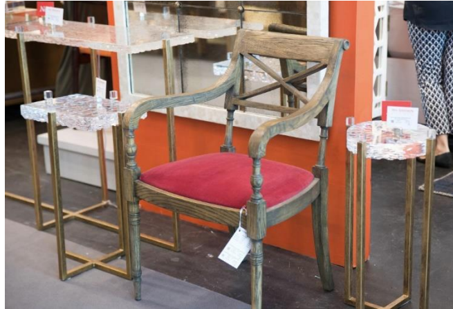
Figure 21 Furniture style year 2017 Source Document Exhibition

to combine with your old furniture whether vintage, modern or industrial. Preferably for your living room, dining room and kitchen there is no insulation for the room to impress. Wallpaper selection should also be considered to be suitable in combination with Mid-century style interior. Choice of marble or brick motif is also suitable to be not effective monotonous.