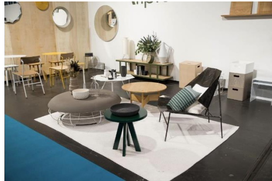
Figure 20 Furniture Exhibition 2017

There is a continuous red thread between the time span in the development style of the design. Until now we can still find furniture retro design interesting in those eras that can still be paired beautifully in public places such as cafes, restaurants, hotels, etc. A unique uniqueness indeed, when retro furniture is chosen to be the main idea in this study. The essence of retro furniture as a discourse in this research can not be denied related to the design world. Trend development, style, and the theme will always give birth to something we will feel. In other words, if work becomes massive domination and is expected not to forget the essence of the design, as works that have style and theme.