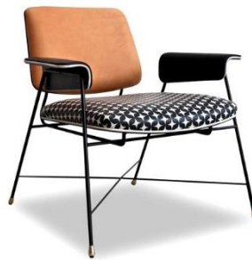
Figure 4 Seats

One example is this beautiful wooden chair. It was designed by Carl Hansen & Søn for a furniture company in 1950 and is now re-introduced.