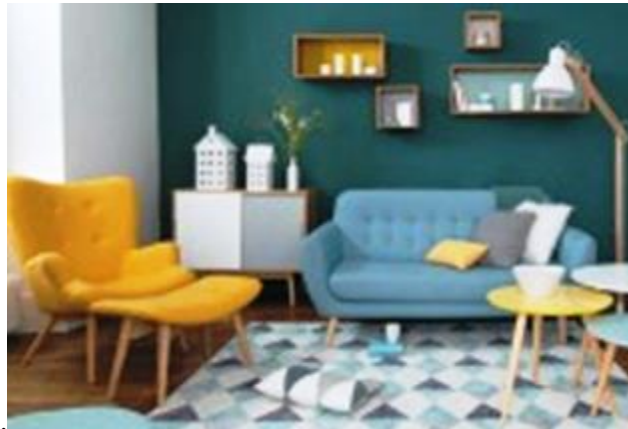
Figure 16 Design living room Retro Style Furniture

Interior with retro-style looks interesting and impressed unique. This style is fitting for those who are full of creativity and have high imagination. The retro-design interiors characterize the open-ended people. In retro style The use of bright colors characterizes. Bright colors like red, pink, yellow, orange dominate any artwork that is retro-styled. In interior design, retro style is livened up with the use of decorative forms such as large made geometric shapes or colorful lined lines. The retro style has its own features that distinguish it from the previous interior style, or even with the later period. In this review, there will be a source of inspiration in organizing the interior with a retro spirit, which basically takes the idea of the interior setting of the 1960-era to 1970 it's