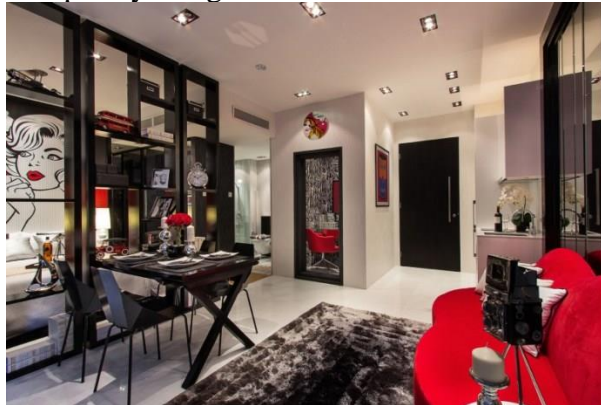
Figure 2 Retro Design

From some sources above, furniture that is used to create a retro feel are antiques that originated from the year 1930-1970-an, furniture that has a pattern of wallpaper and cloth and has a slightly curved shape to create the impression Classic. So it can be said that the furniture in the form of simple, functional and aesthetic value and made from synthetic materials will be easier to create a retro feel. For a fun and enjoyable atmosphere, the retro design is perfect because it features light, bright and dynamic colors. In order not to be too old age, retro design can be combined with a minimalist or contemporary design.