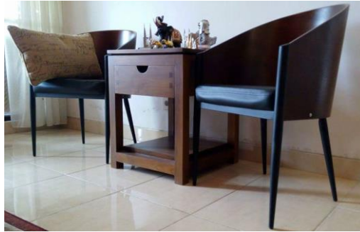
Figure 15 Retro Furniture