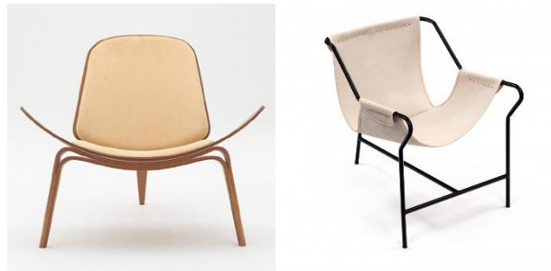
Figure 6 Retro seats

1. Wooden chair designed by Carl Hansen & Søn for a furniture company in 1950, and now re-introduced.