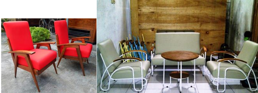
Figure 13 & 14 Retro Furniture-Residential

3. Some examples of retro furniture design in the residence as follows: