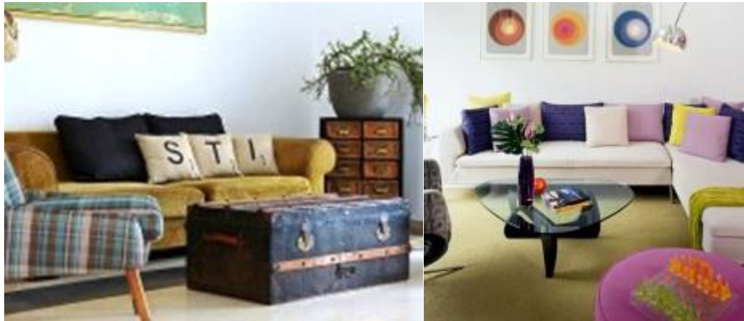
Figure 17 Retro furniture colors

The essence of retro interior design lies in its color. Today, retro design tends to use shocking colors, such as orange, blue, and red. Or geometric motifs combined with modern design. As a supporter, the selection/use of wallpapers with motifs more daring.