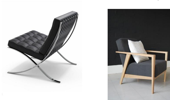
Figure Retro 7 seat image

2. At the same time at the beginning of the year 2017 at International Furniture & Craft Fair Indonesia (IFFINA), Jakarta International Expo and Indonesia Furniture Show held also exhibits various theme Furniture. As predicted before, it turns out many of the industry exhibitors furniture participants featuring a variety of furniture, partly vintage style, but that dominates retro-style furniture. They do not feature modern-style furniture, let alone a minimalist style that in its appearance does not last long.