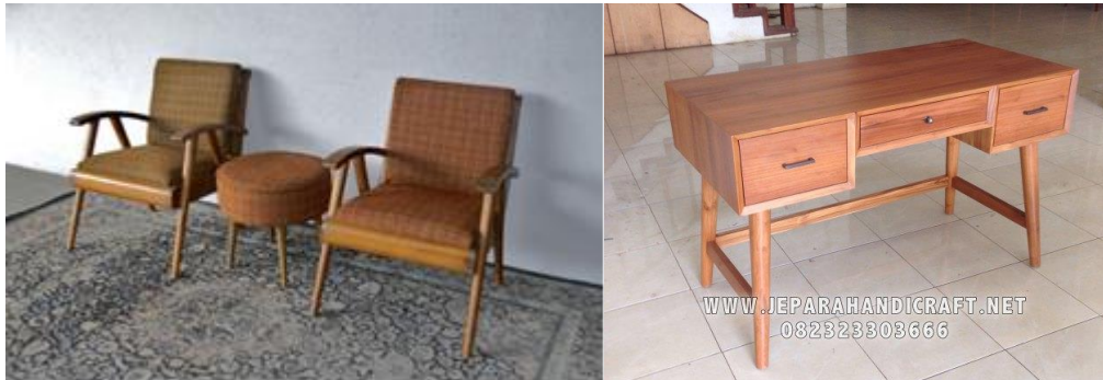
Figure 1 Chair and Table Retro