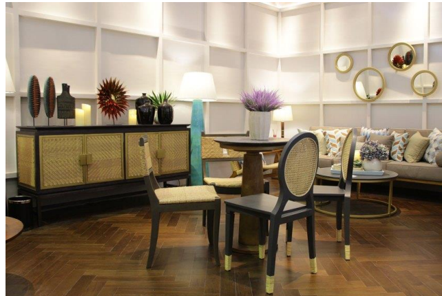
Figure 8 Retro Furniture