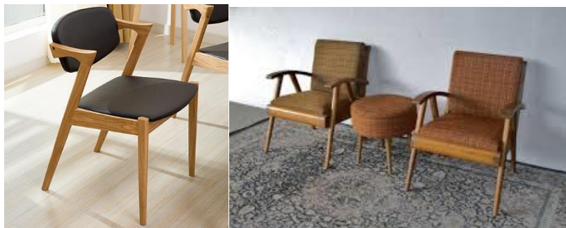
Figure 9 & 10 Retro Furniture