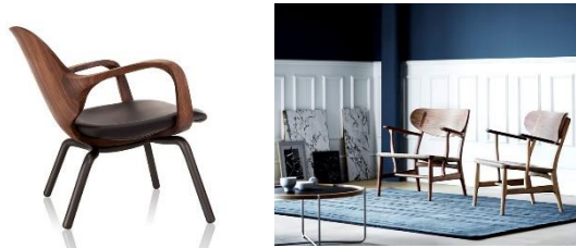
Figure 3 Seats

From the preliminary study that we do, hopefully, can simplify and clarify the understanding of retro related furniture design. Preliminary studies that have been conducted are looking for data literature information on design books, data that is partially obtained, among others, as follows: