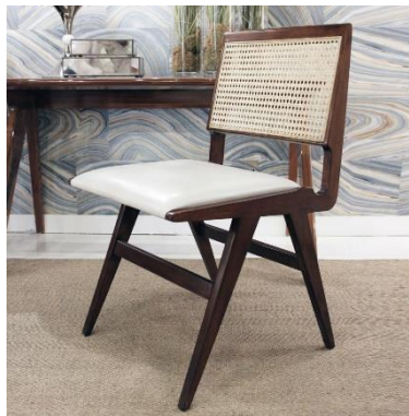
Figure 19 Retro Style seat pictures Document: Dock. Creation Atmosphere

Retro style can be displayed in the optical form and organic form, as well as colorful in bright tones. The retro design is a style that all the arrangement went back to the decorations from 1960 to 1970. The retro word itself is short for retrospective, which is "back to the past". Usually the colors of motifs and retro colors are more captivating and provide comfort. One of the dominant characteristics of this understanding is the use of synthetic materials accompanied by a combination of cheerful colors and geometric shapes. "Features more retro furniture using color options and graphical form with a flat field so it is more cheerful and not flat".