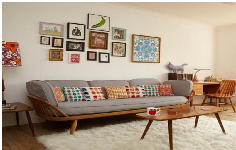
Figure 18 Retro Furniture Living Room

Indeed the past is sometimes able to inspire for the present life. Therefore, in the world interior design, many people who want to pour the past was in the interior design of his home. The interior design of retro style is an interior design style that reveals and reassociates it with the style of the past. The word retro is derived from the English word "retrograde" meaning it has a relation to the past styles.