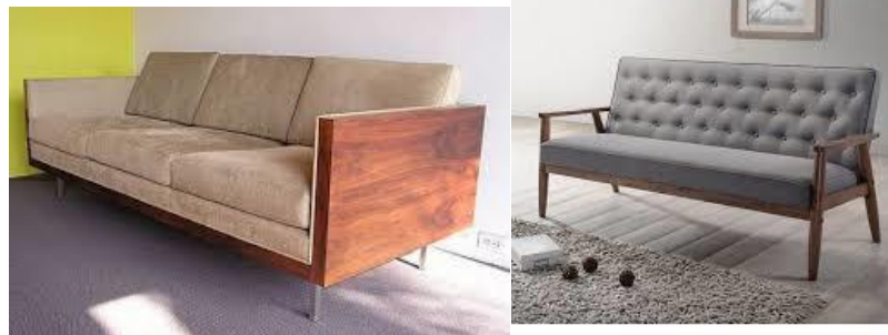
Figure 11 & 12 Retro Furniture